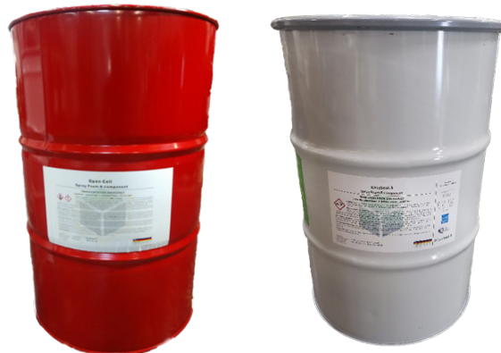
FIGURE 1. EASYSEAL.5™ ISOCYANATE (A-SIDE) AND RESIN (B-SIDE)