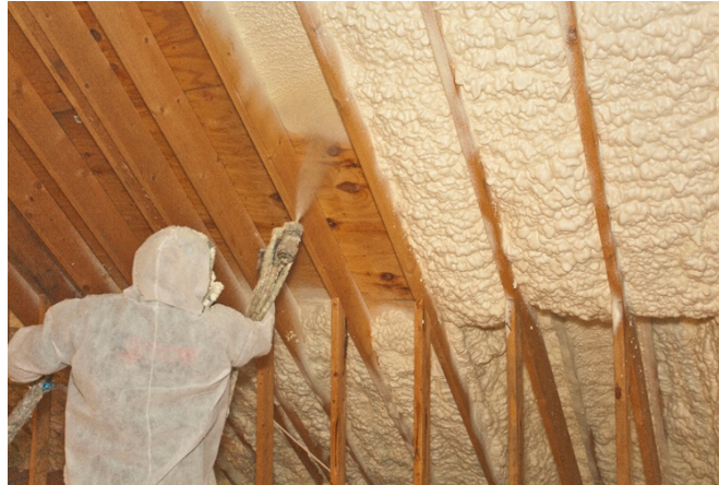
FIGURE 2. APPLICATION OF EASYSEAL.5™ SPRAY FOAM INSULATION IN AN UNVENTED ATTIC