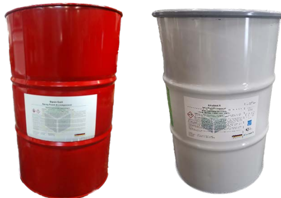
FIGURE 1. EASYSEAL.5™ ISOCYANATE (A-SIDE) AND RESIN (B-SIDE)