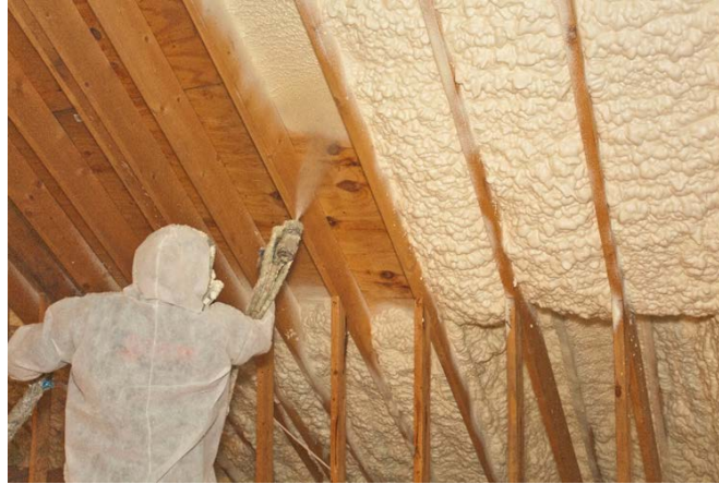
FIGURE 2. APPLICATION OF EASYSEAL.5™ SPRAY FOAM INSULATION IN AN UNVENTED ATTIC